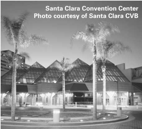
Santa Clara Convention Center