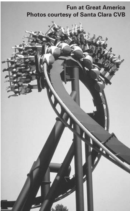
Fun at Great America

The conference will be held at the Santa Clara Convention Center and the Hyatt Regency Santa Clara (which are next door to each other). It's a great location and (if you can manage to find the time) there are many wonderful places to see and things to do nearby. If you're flying, the San Jose airport is less than five miles away, and the Oakland and San Francisco airports are both about an hour away by car.