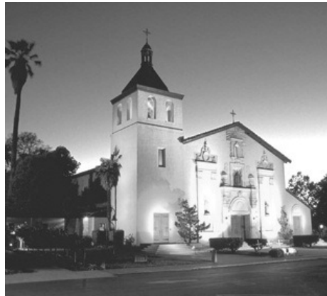
Mission Santa Clara de Asis on the campus of Santa Clara University